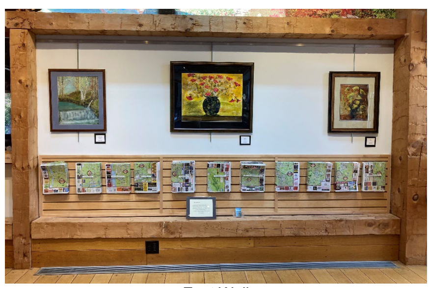
East Wall Art space is approx. 4' tall x 8' wide.