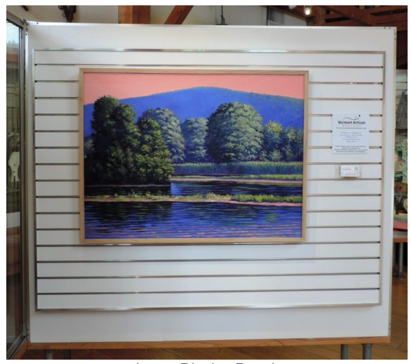
Large Display Panel 37" tall x 5' wide.